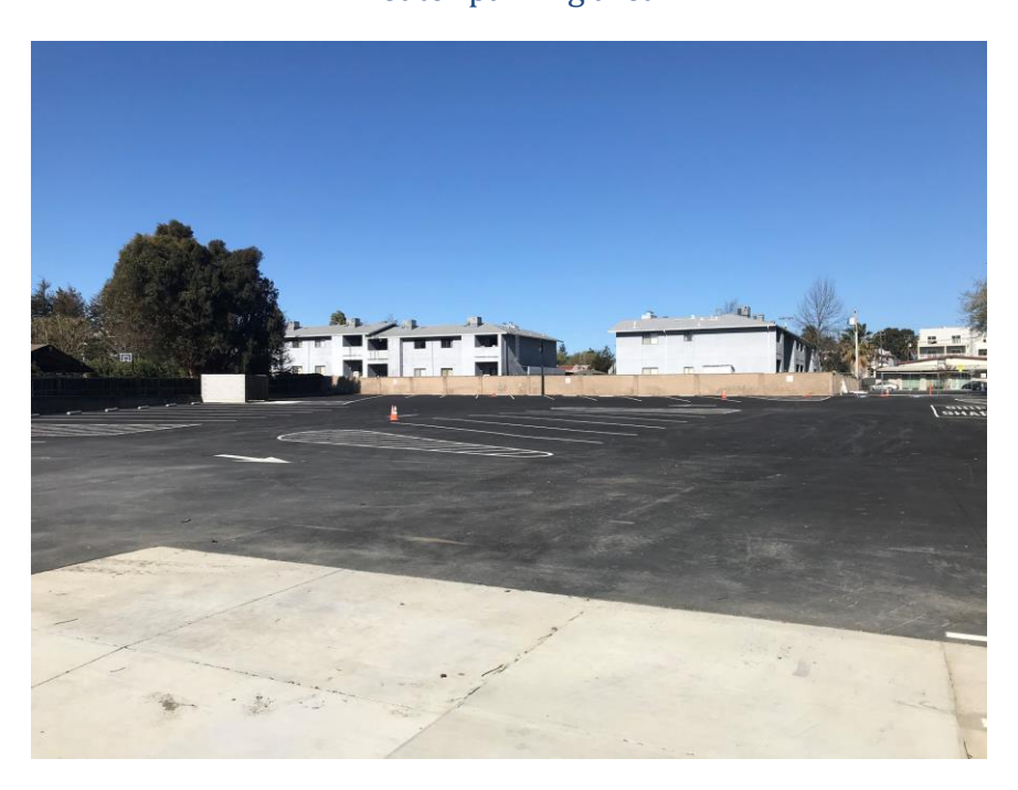
Accessible parking stalls and path of travel